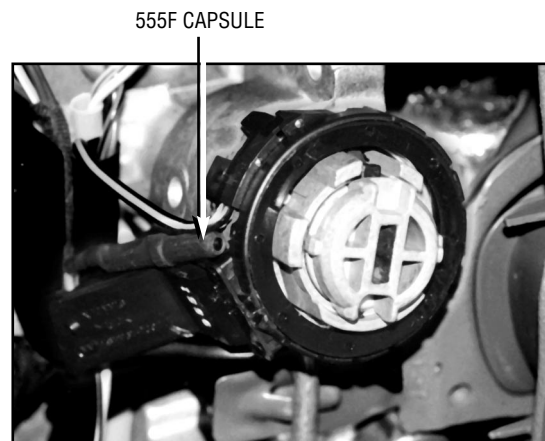
1997 Mercury Sable