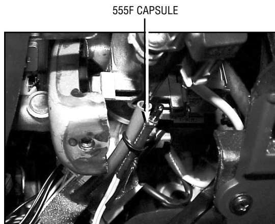
2000 Lexus RX300

NOTE: The examples of capsule mounting locations shown below are provided as a general reference only. Actual mounting locations for other vehicle makes and models may vary. Additional capsule mounting locations for specific vehicles can be found on DEI's technical website, www.directechs.com .